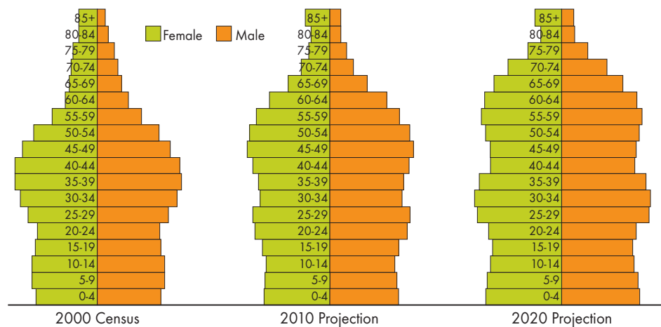
FIGURE 6: Age Pyramids, Central Puget Sound Region