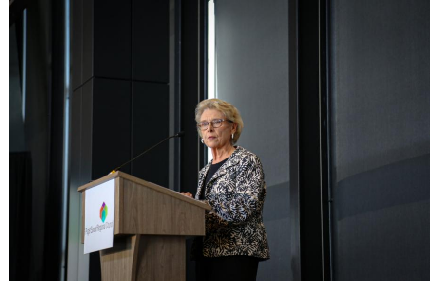
Governor Chris Gregoire at PSRC's 2026 General Assembly