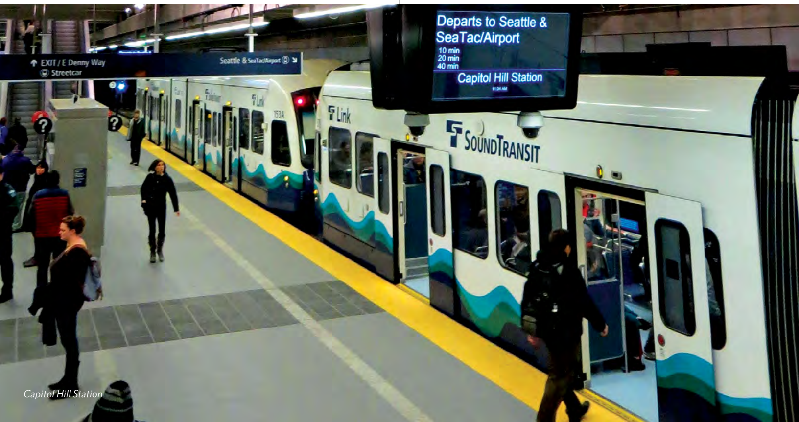
Capitol Hill Station

Rapidly developing technological innovations have the potential to disrupt and transform the way we think about transportation systems. These changes range from improvements to existing technologies, including Intelligent Transportation Systems, to shared mobility, improved traveler information tools, and connected or autonomous vehicles. These innovations could have an enormous influence on how and where people live, shop, work, and play, and how the region develops and designs roadways and other transportation infrastructure. The expanding shift towards on-demand mobility services and new technologies supporting those fleets has the potential to change trends in private car ownership and usage, local and regional parking needs, and the use of public right-of-way for pick-up and drop-off zones. Similarly, the rise in e-commerce and urban delivery will have impacts on both the transportation system and land uses throughout the region. However, the rapid pace of change in technology makes it hard to predict when new technologies will mature and become widespread, and what the impacts will be on the system. The region must prepare for this potential transformation and ensure those changes support the region's communities and vision for the future.