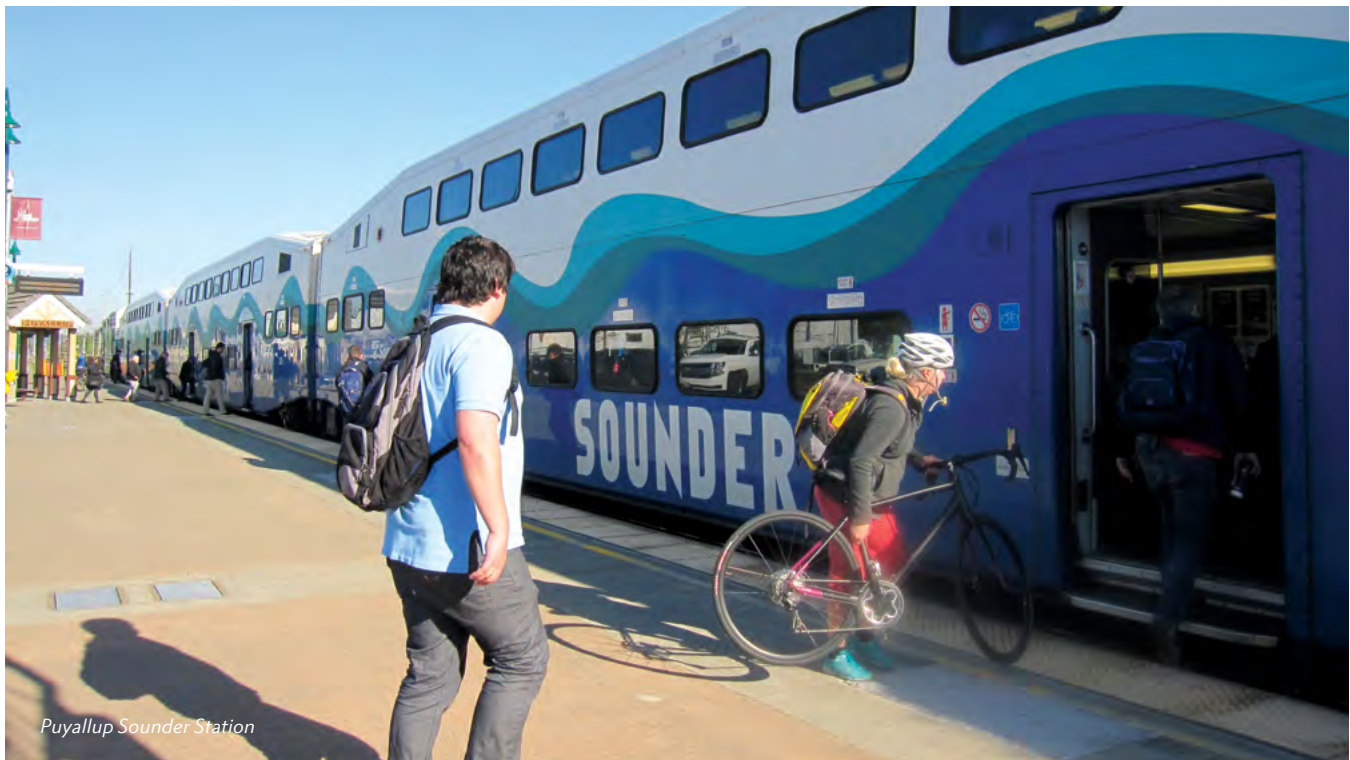
Puyallup Sounder Station