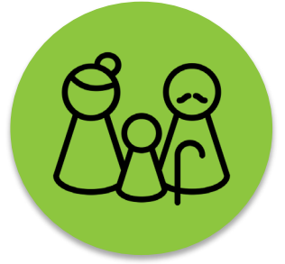
Community Focus Groups