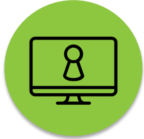
Virtual Outreach Meetings