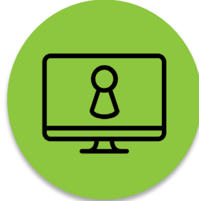
Online Open House