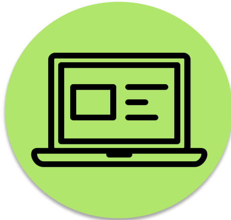
Equity Advisory Committee