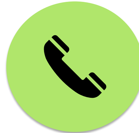
Employer / Business / Military Interviews