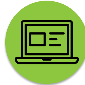
Virtual Public Meetings