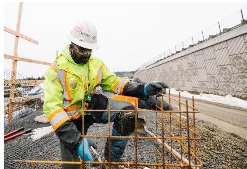
Local infrastructure resources