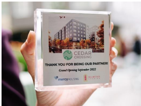
Affordable housing gap funding