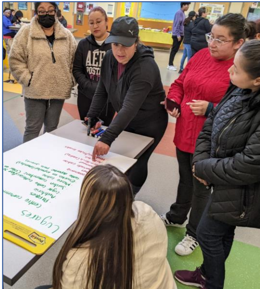
Latinx Community Meeting - April 2022