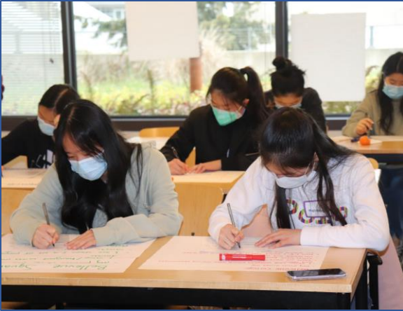
Chinese Student Meeting - April 2022