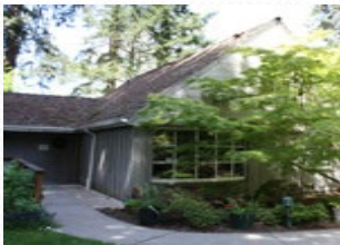
Kenmore Senior Center 6910 NE 170 th St, Kenmore

As a volunteer-led 501(c)(3) community organization, NSC has been a vital source of inspiration, human connectivity, and innovative wellness for 50 years.