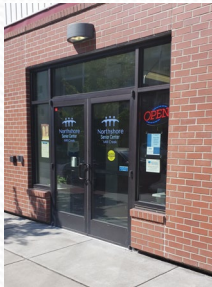
Mill Creek Senior Center 4111 133 rd St SE, Mill Creek