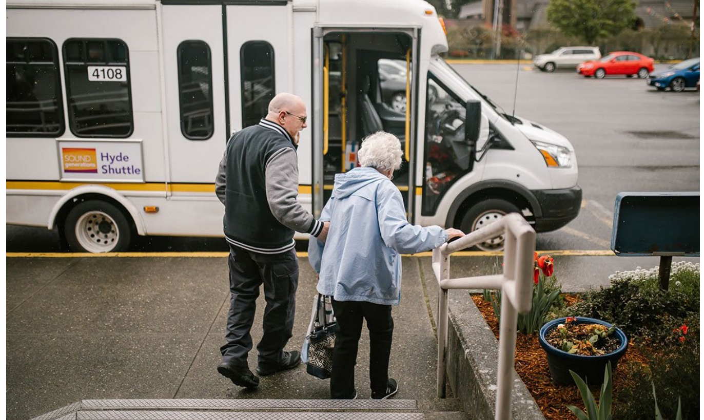
Image of Sound Generations' Hyde Shuttle https://soundgenerations.org/our-programs/transportation/hyde-shuttle/