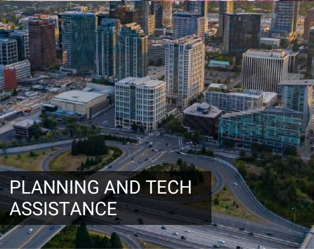
PLANNING AND TECH ASSISTANCE