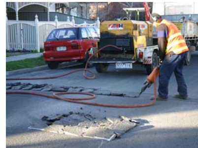
Construction noise can adversely affect human health.

Construction noise associated with any project element would be intermittent, occurring at different times during the construction and at various locations in the project area. Construction noise levels would depend on the type, amount,