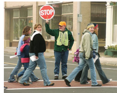
Walking to school could help children incorporate physical activity into their daily routine.

In 1996 the U.S. Surgeon General issued a report titled Physical Activity and Health . The report states significant health benefits can be obtained through moderate activity, citing walking and bicycling as two types of physical activity that are the easiest to adopt and adhere to over the long term. Yet, a variety of barriers inhibit walking and bicycling; some are subjective (time and lack of motivation) while others