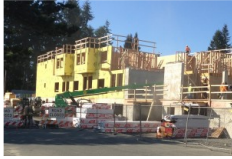
Vineyard Park, a new development under construction in Mountlake Terrace's growing town center.

Mountlake Terrace is busy building a town center and getting ready for light rail that is anticipated in 2023.