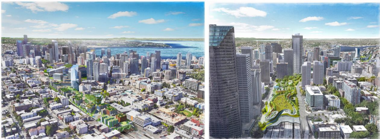
Figure 1 - Conceptual renderings of what lidding I-5 could look like in Central Seattle with a mix of parks and development

We are disappointed to see the Lid I-5 Seattle project is not mentioned in the draft, especially after it was included in the 2024 RTP (page 182) as a “big idea.” The Downtown project is actively moving forward using over $2 million in WSDOT and FHWA funding for design and community engagement, it is endorsed by Seattle’s comprehensive plan and city council policy , and it is included in the Washington State Transportation Improvement Plan. The U District effort is similarly moving forward with federal and city funding. The Lid I-5 projects in Downtown and the U District deserve continued recognition at the regional level.