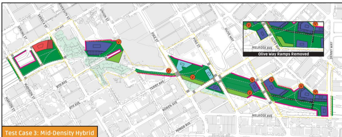
Figure 3 - Excerpt from the I-5 Lid Feasibility Study showing one of the test case land use scenarios, with a mix of parks (green), mid-rise buildings (red and light blue), and high-rise buildings (dark blue)

Locally, lidding I-5 is supported by Seattle policies: