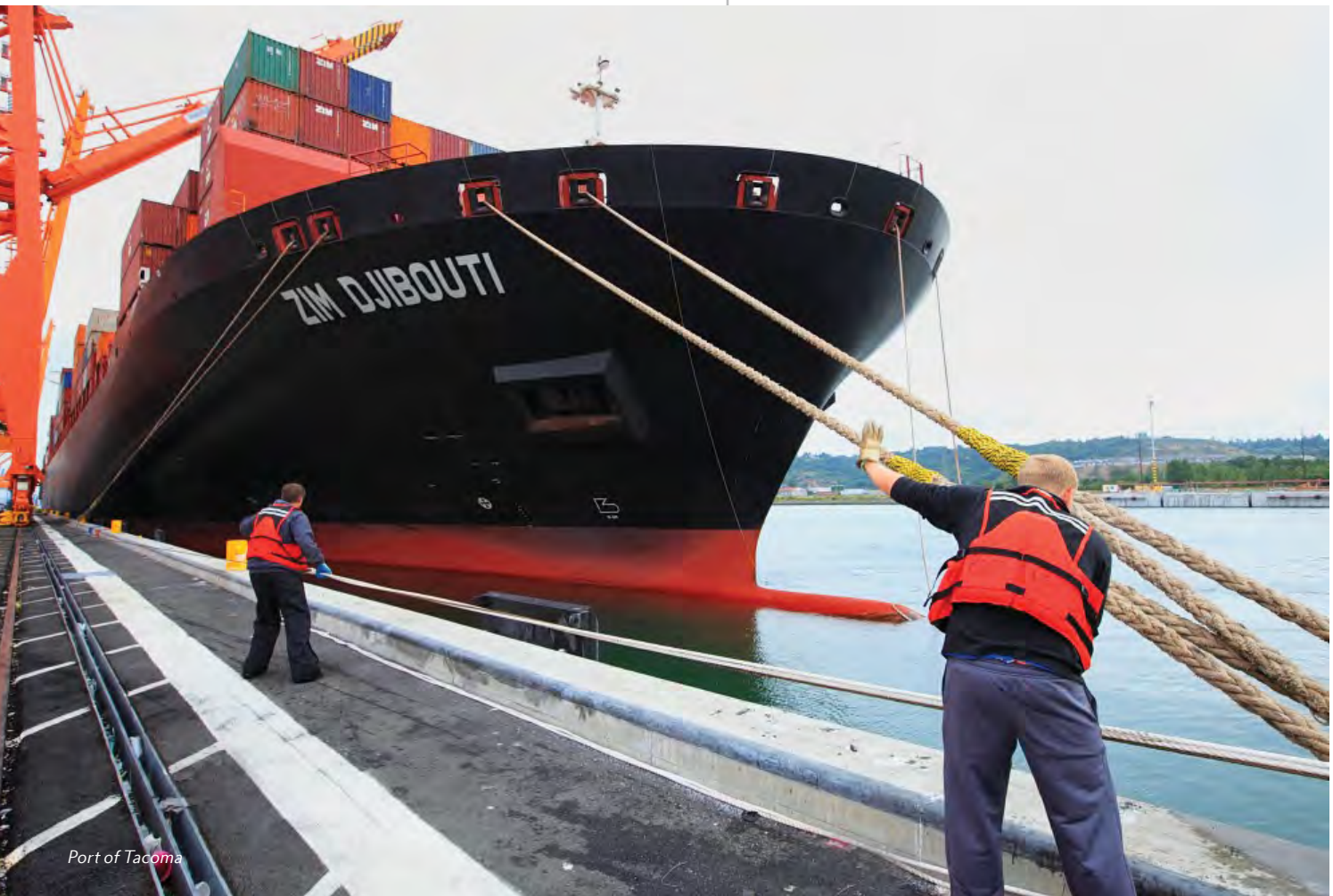
Port of Tacoma

While the region has benefited from one of the country’s strongest local economies, not all parts of the region have benefitted equally. Jobs in the information, technical, and management sectors pay the highest average wages and saw some of the largest increases in jobs and wages since 2010. Nearly all this job growth in the region has been concentrated in a few urban areas. VISION 2050 calls for a better balance of equitable job creation among the counties to broaden opportunity and create a better jobs-housing balance.